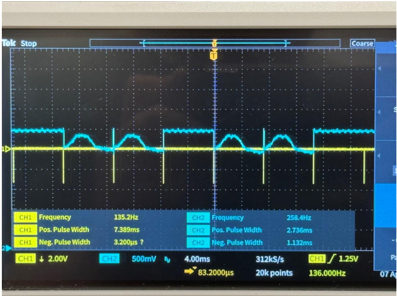
Figure 2 Single capture of the CCD output with this timer settings we ran into an issue the SH does not transition High in the timeframe of ICG being Low. Extending the ICG off time allowed for correcting these missed frames.